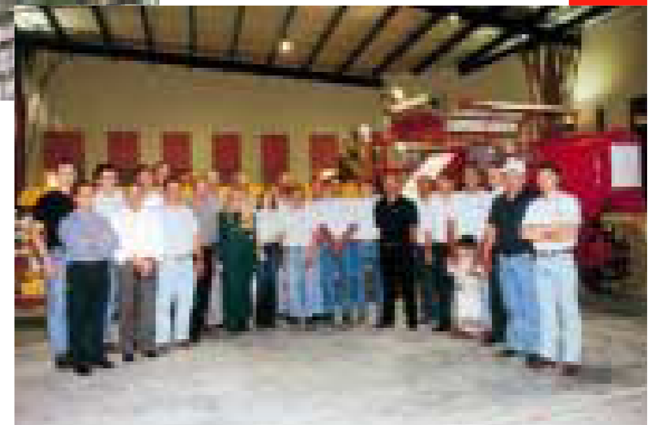
The team from CLAAS Argentina, whose hard work enabled the restoration to be done.