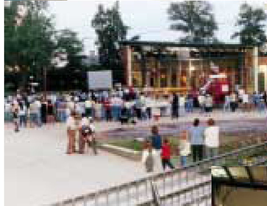
Some 500 visitors attended the ceremony and admired the Rotania combine in its new museum.